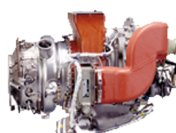
Saab 2000 APS1000-C7