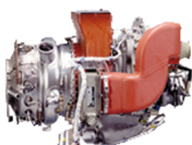
Fokker 50 APS1000-C2