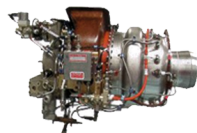
Bombardier Dash 8-400 APS1000-C12